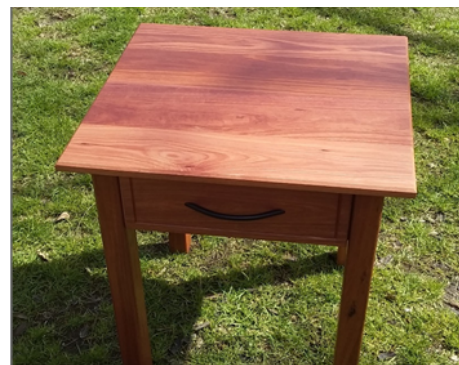
Bedside Table by Mitchell Pearce