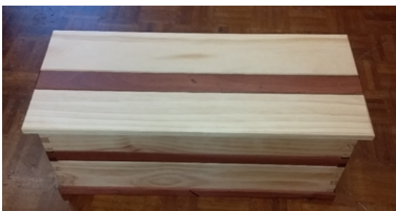
Storage Box by Louis Marchesano