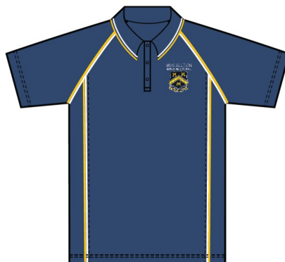
Sports Polo Shirt